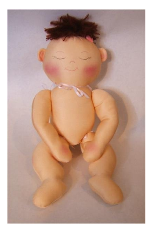
An Asleep face all made of little curved lines.