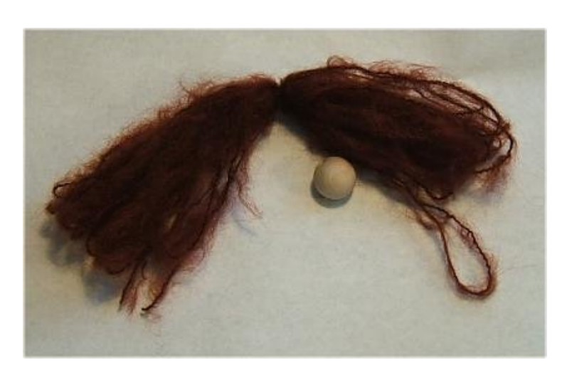
Prepare the yarn...I have used the wooden ball.