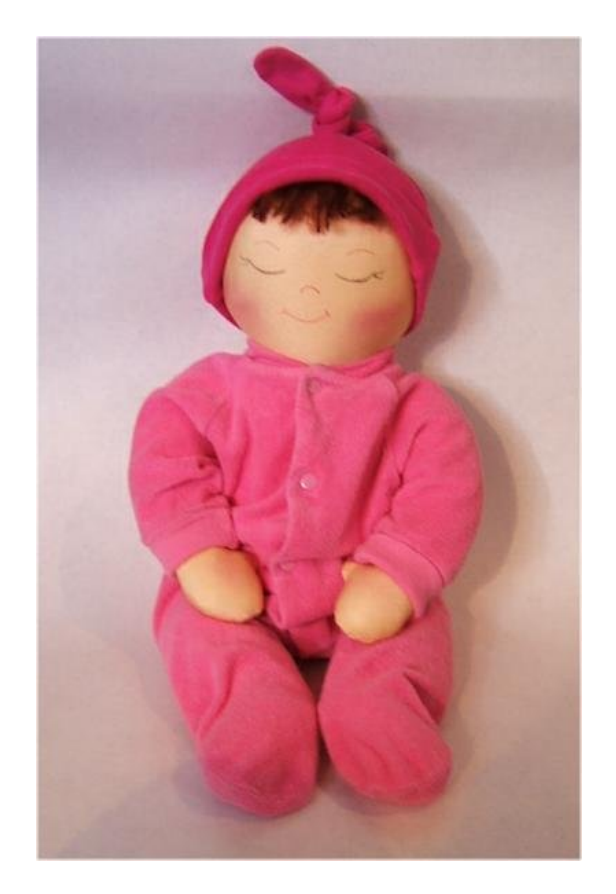
All ready for bed. The cap covers the awake face.