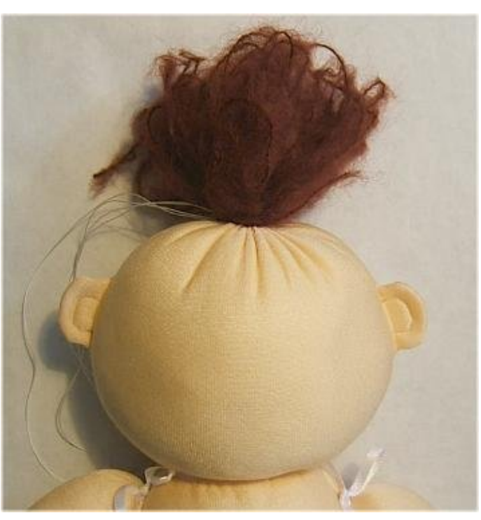
Pop the yarn and ball into the opening and tie REALLY tight!