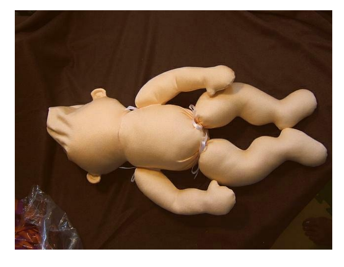
Stuff the tummy full and then fill the head pretty well.