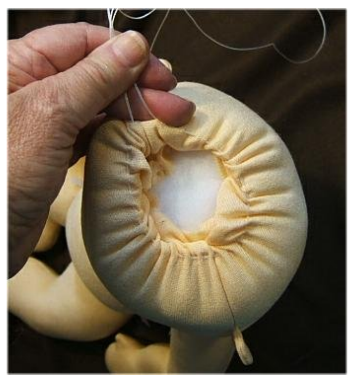
Gather the top of the head along the line shown in the pattern. The excess fabric pushes into the head. Be sure to look at your Baby and add stuffing into the head to make it nice and plump.