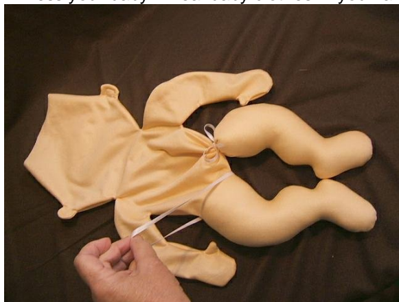
Stuff the feet and legs and tie the hips.