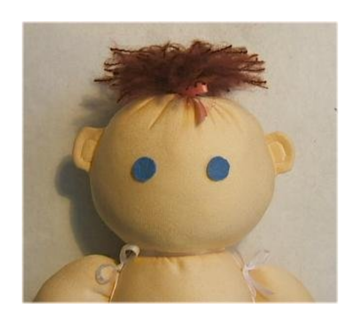
Make the eyes low on the head.