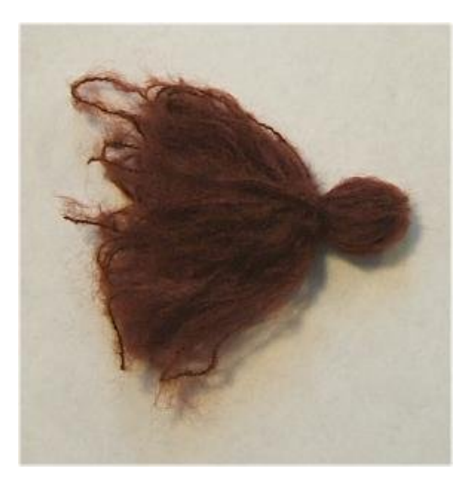
Tie the ball into the center of the yarn.