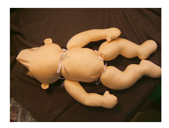
Tie the neck.