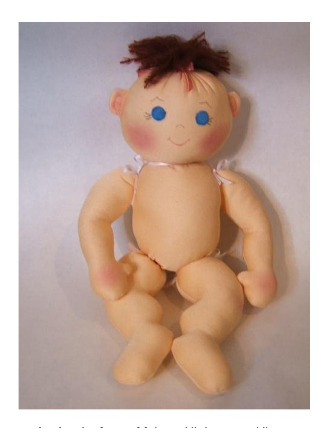
An Awake face of felt and little curved lines.

Remember, this is a 2 faced Baby. The asleep face will be on the other side. Just turn the PJs and cap around.