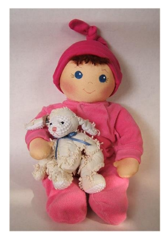
All ready for play. The asleep face is covered by the cap. I added little white dots in the eyes too.