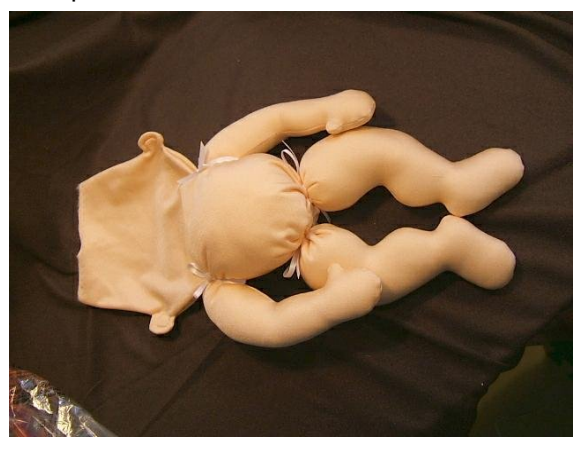
Stuff hands and arms and tie the shoulders. Stuff into the tummy now too.