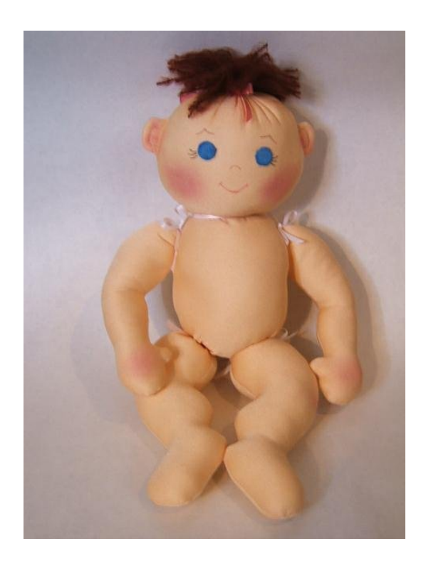
The awake face made of little curved lines and felt.